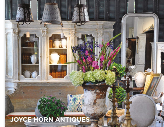
JOYCE HORN ANTIQUES

Family-owned and -operated since 1976, this revered Houston institution offers decorative hardware, plumbing and fixtures. If its showroom doesn't inspire you to get cracking on that home renovation, we don't know what will. 3600 Kirby Dr., 713-942-9519, westheimerplumbing.com